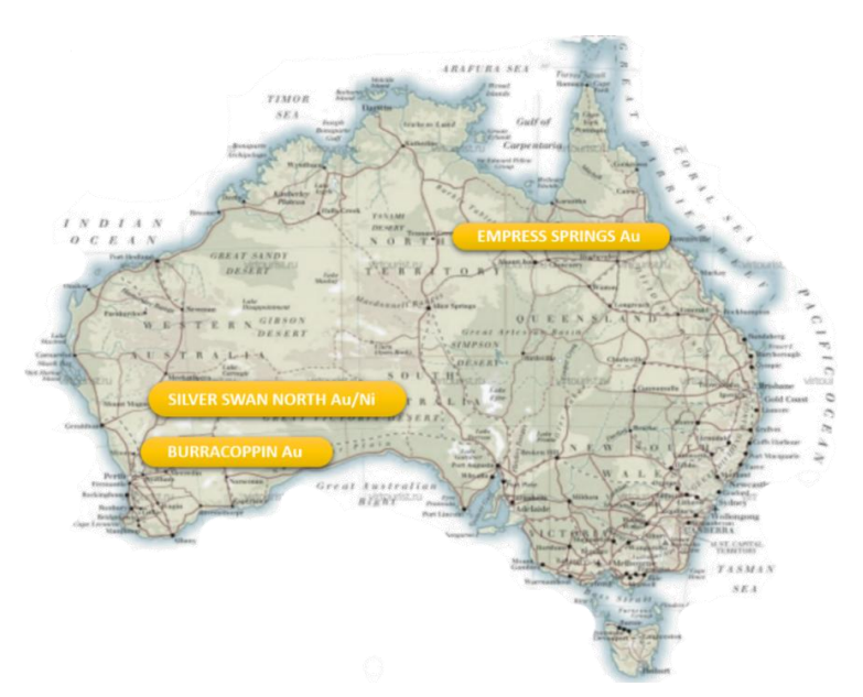
MAP OF MOHO'S PROJECT AREAS

Moho Resources Ltd is an Australian mining company which listed on the ASX in November 2018. The Company is focused on gold and nickel exploration at Empress Springs, Silver Swan North and Burracoppin.