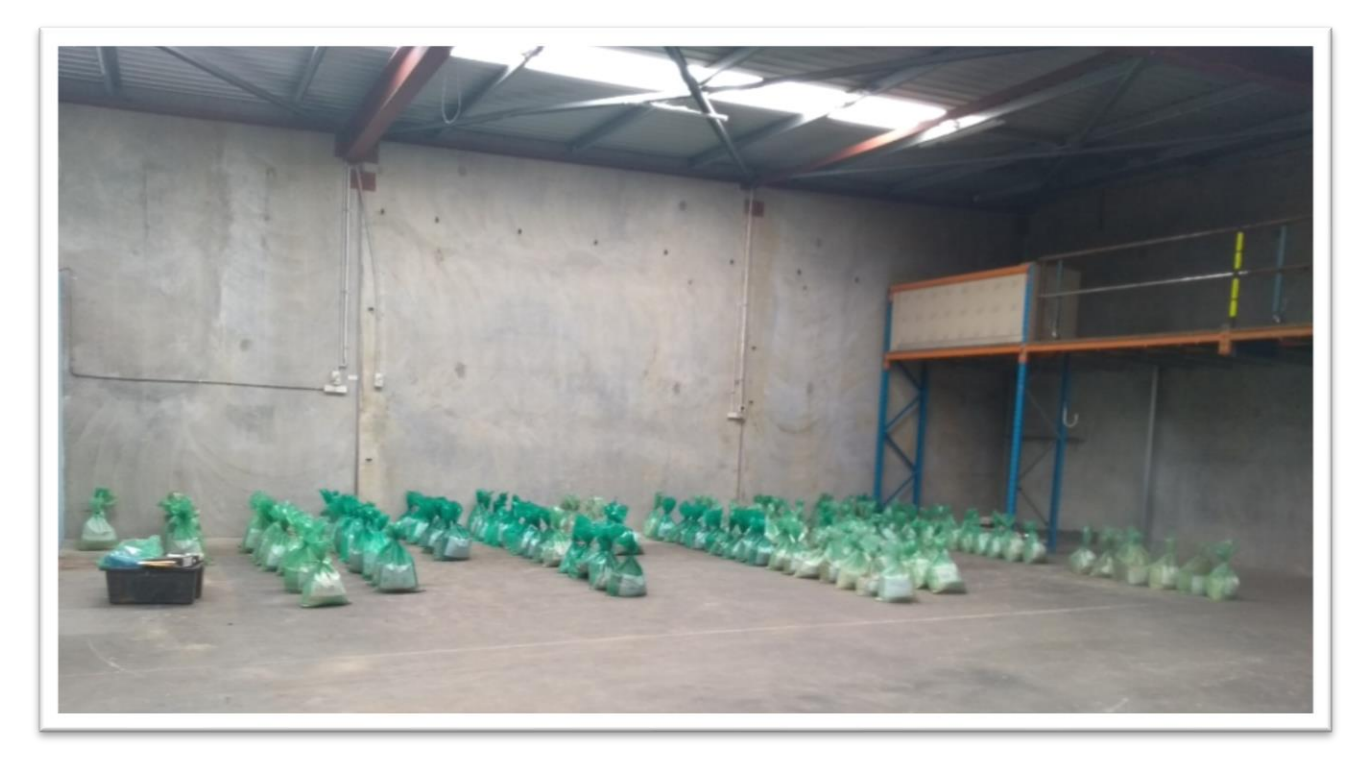
Figure 2: East Sampson Dam metallurgical samples at Moho's Perth storage facility

Desktop mine project evaluation by Moho's consultant mining engineer Minero is ongoing. Minecomp Pty Ltd, a Kalgoorlie-based mine planning company, has been engaged to undertake first pass Whittle optimisation using preliminary grade blocks assessed and provided by CSA, to determine the likely mining inventory for the project.